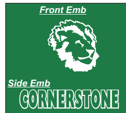
Baseball Cap w/ Emb on front and side (white, black, hunter) Circle Color $16.00