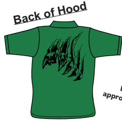
Full Zip Hooded Sweatshirt w/ left chest and back print (Ripping Claws) (Offered in White, Dark Green and Grey) Youth $25.00 Adult $28.00