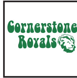
3/4-length Sleeve Baseball Shirt Youth $15.00 Adult $16.00