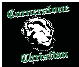
Men's & Women's Thermals W/ Emb (Deep Heather, White) Men's $22.00 Ladies $22.00