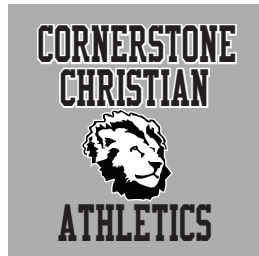
50/50 Grey Gym Shirt Youth $9.00 Adult $10.00