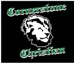
Full-Zip Fleece Jacket W/ Emb (Black or Grey) Men's $38.00 Ladies $38.00