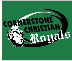
Lightweight Cotton T-Shirt (Offered in Dark Green, White and Grey) Youth $14.00 Adult $15.00

Design applies to both Lightweight Shirt and Full Zip Hooded Sweatshirt (Left Chest Front Print & Full Back Print)