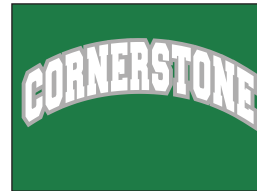
White on Grey Felt w/ Bean stitch on Forest Green Hoodie Lion head embroidered on hood Youth $30.00 Adult $33.00